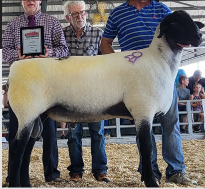
Grand Champion Ram