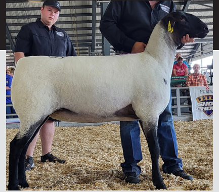
Grand Champion Ewe

VIEW THE NEW SCHEDULE ONLINE www.midwestsale.com