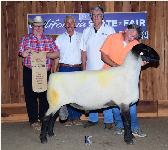
2023 California State Fair Grand Champion Suffolk Ram Barmac Farms 21-517