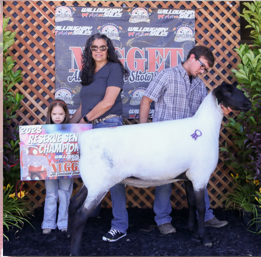
2023 Reno Nugget Reserve Grand Champion Suffolk Ewe.

HAPPY HOLIDAYS AND OUR SINCERE WISHES AND PRAYERS FOR A SAFE AND PROSPEROUS YEAR IN 2024.