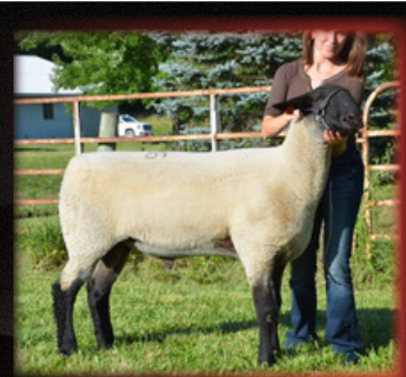
Whispering Hills Suffolks 2234